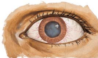
Uncontrolled diabetes can cause eye disease.