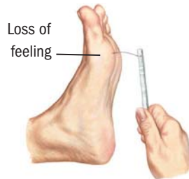
Loss of feeling